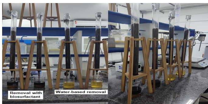
Figure 2 Removal of adsorbed petroleum oil in sand through the bioremediation process using biosurfactant produced by S. bombicola ATCC 22214 in packed columns via static test.