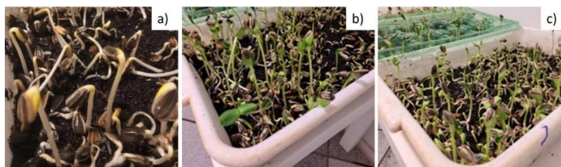
Figure 1 – Sunflower sprouts (a) before lighting, after lighting in Chambers (b) 1 and (c) 2.

Chlorophylls, the pigments that make vegetables green, can degrade during processing, altering the color of foods. Sprouts' color is an important attribute that affects consumer choice and food acceptability, indicating its quality (WOJDYLO et al., 2020). Figure 1 shows the sprouts before lighting in Chamber 1 (when the green color had not yet developed) and after lighting for 27 h in both chambers. The sunflower sprout samples varied significantly between the two chambers, presenting values of 223.56 \pm 0.08 and 262.39 \pm 0.08 mg of chlorophyll /g of sprout, with the highest chlorophyll content obtained for the ozonized sample.