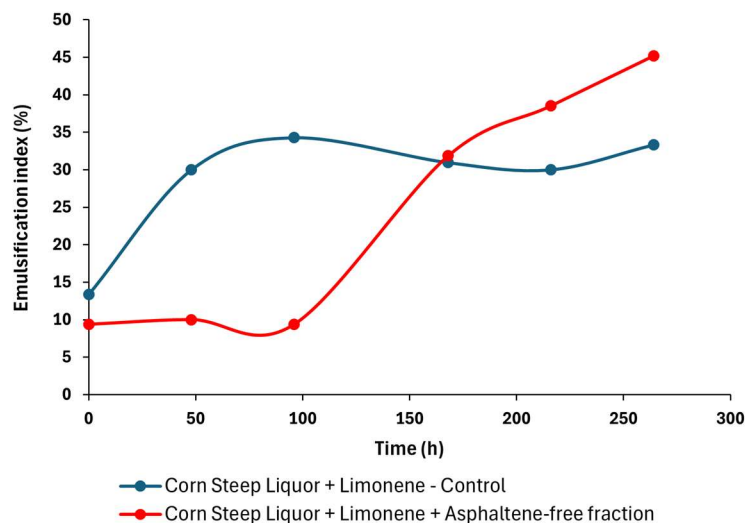
Figure 2 Emulsification index from Yarrowia lipolytica cultivation Erlenmeyer flasks (500 mL) containing 200 mL of media with corn steep liquor and limonene, with and without crude oil asphaltene-free fraction, at 160 rpm, 28 °C.